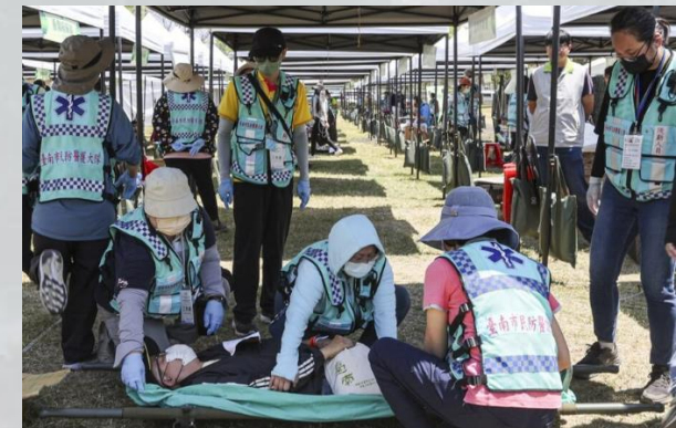
■ Expanding emergency medical facilities