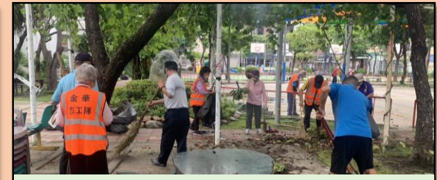
■ Volunteers clean up the environment