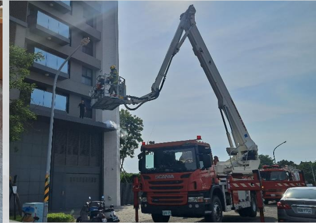
■ Fire Department Disaster Rescue Brigade