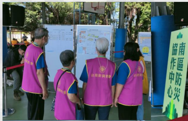
■ Disaster Prevention Cooperation Center opened