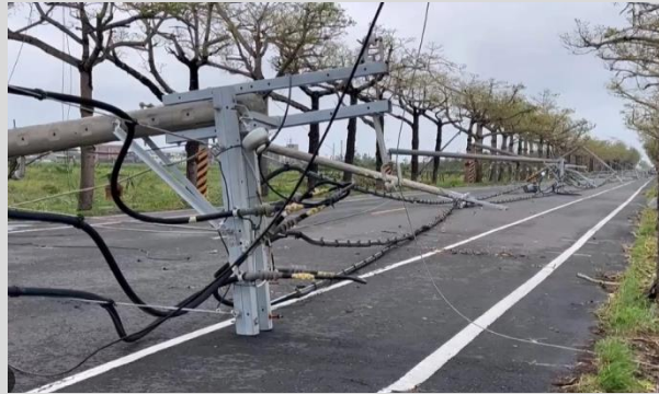
■ Jiangjun District