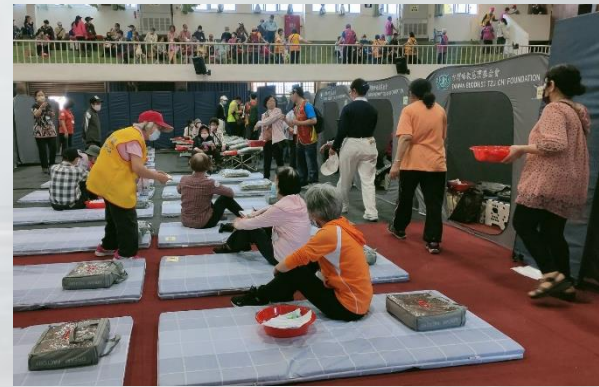
■ Shelter dresettlement