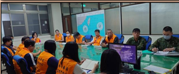
■ Response centers opened