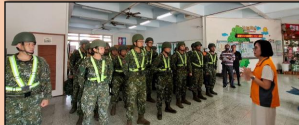
■ ArmySupport disaster relie