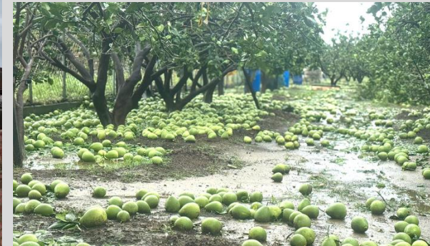
■ Madou District