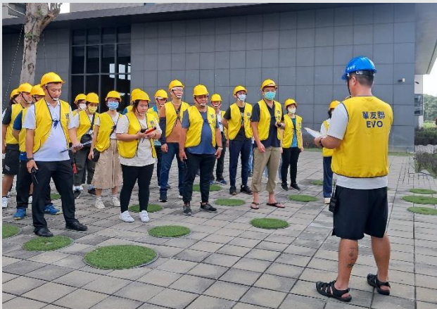
■ Building self-defense firefighting team

In conjunction with the self-defense fire-fighting teams of community buildings in the jurisdiction Xinanli autonomous disaster prevention community organization and other units , we have joined in disaster relief, casualty assistance, initial fire fighting and emergency rescue, and the opening of temporary sheltersto enhance the public's disaster prevention and relief response capabilities.