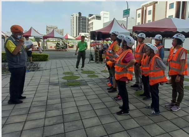
■ Resilience community