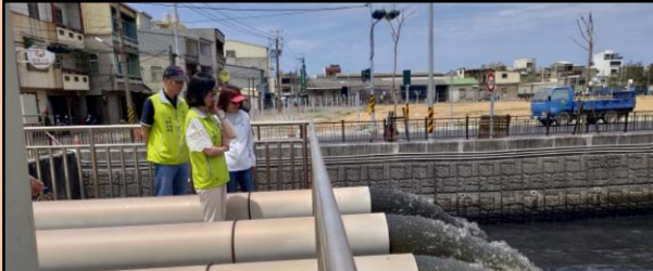
■ Inspection for flood prevention