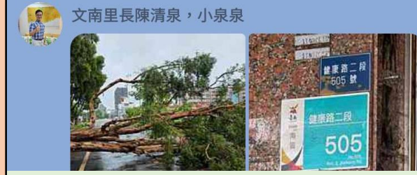
■ Report from the village chief