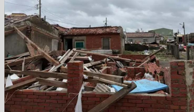
■ Cigu District