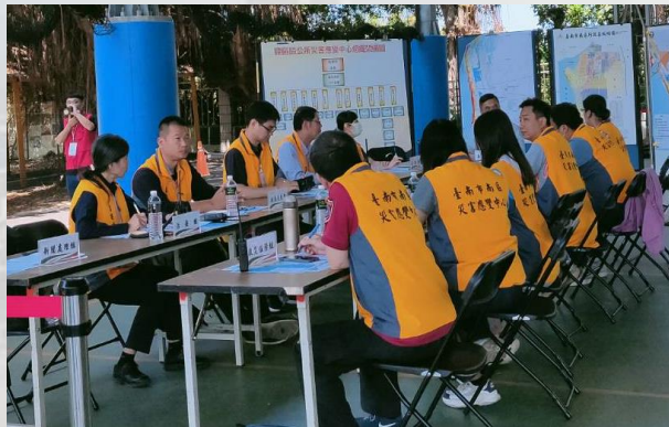
■ District-level response centers opened

The large-scale drill incorporates complex disaster scenarios of natural disasters such as earthquakes, tsunamis, and damage to key infrastructure through real-life, realistic scenes, to verify the disaster response capabilities of central and local governments such as "large-scale evacuation", "shelter and resettlement", and "expansion of emergency medical facilities".