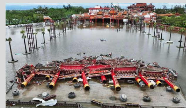
■ Nankunshen Daitian Temple

2025.7.5 Danas caused serious damage to the 17 administrative districts in Tainan