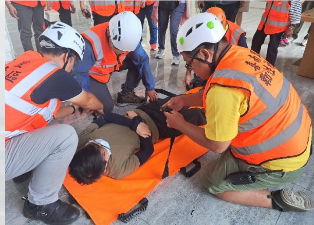
■ disaster resistance