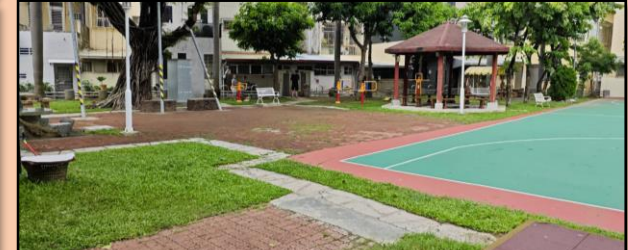
■ Working together to recover quickly